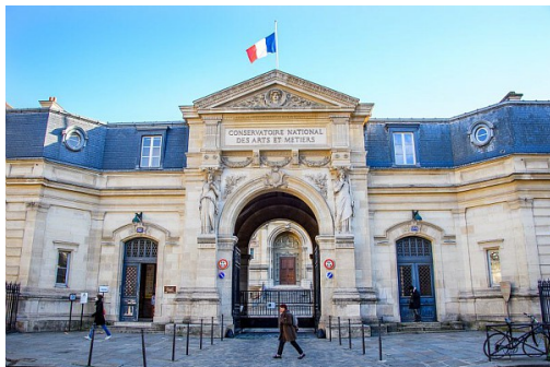
Cnam in Paris